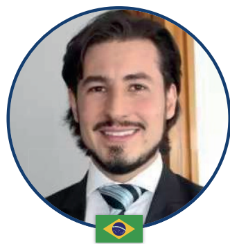
Marcelo Salmaso Judge of the São Paulo State Court of Justice