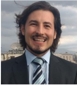
Marcelo Salmaso – Judge of the São Paulo State Court of Justice (Brazil)