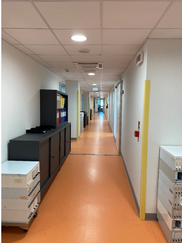
Section dedicated to medical offices and didactic activity